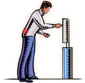
Touch screen too low