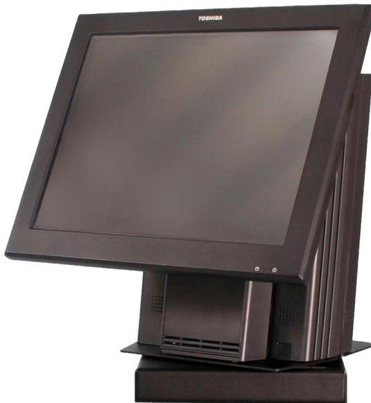
An integrated turntable for the Toshiba ST-A10 TouchPOS

Adding peripherals to POS terminal workstations